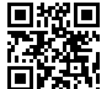
Madison County QR