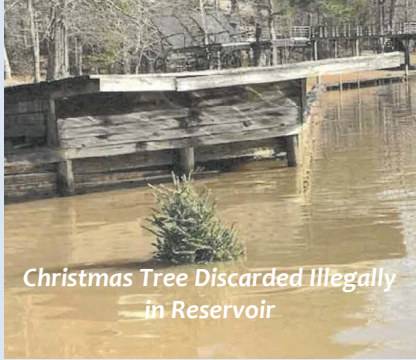
Christmas Tree Discarded Illegally in Reservoir

Dredging progress continues in Pelahatchie Bay. So far, work has been completed in Eagles Cove, Woodward, Sunrise, Paradise, and Audubon Point areas. The dredge is currently