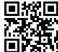
Madison County QR